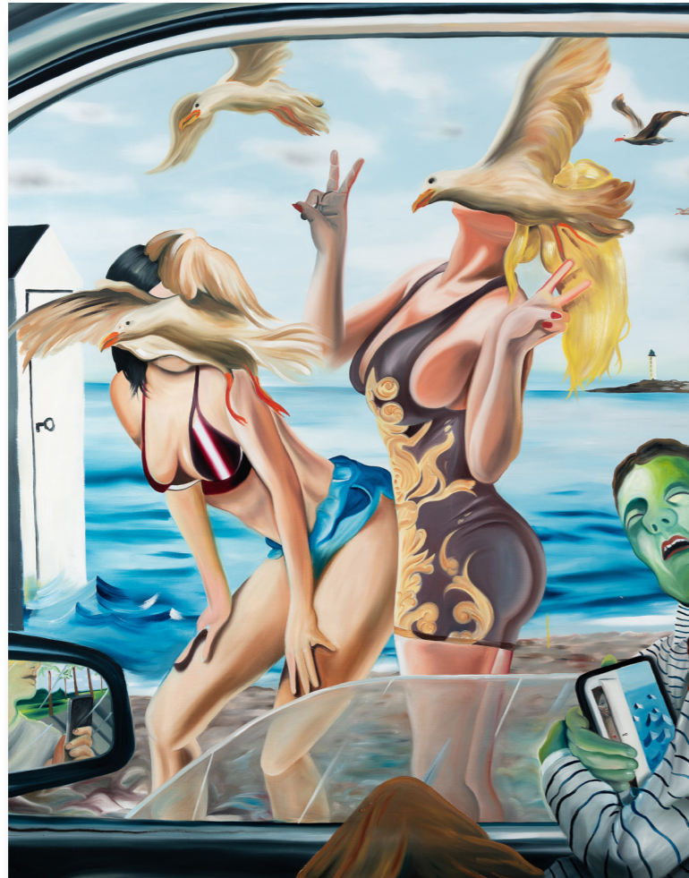
A sleeping man, 20

Oil and airbrush on linen 180 x 140 x 3.5 cm 70 7/8 x 55 1/8 x 1 3/8 in