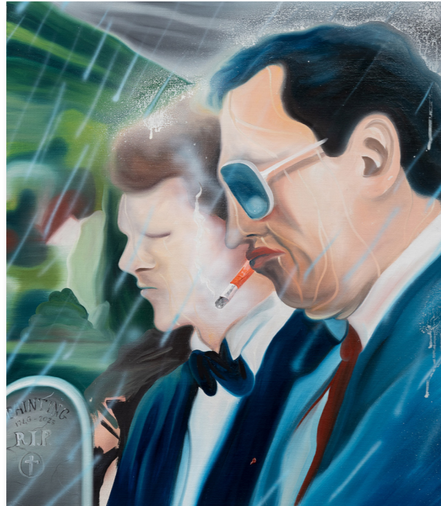
Painting Is Dead, 2023