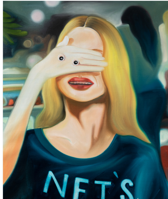
NFT's Unknown Woman, 2023

Oil on linen 65 x 55 x 3 cm 25 5/8 x 21 5/8 x 1 1/8 in