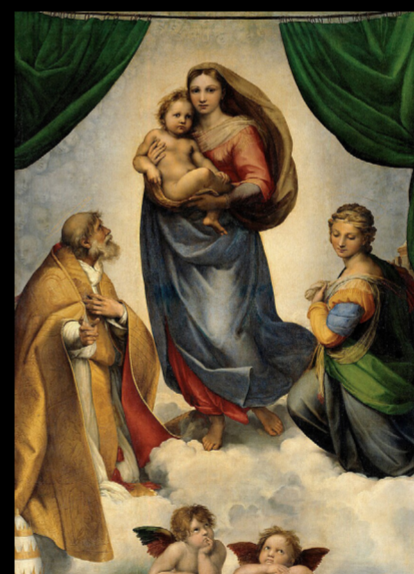
Raffaello Sanzio da Urbino (1483-1520) Madonna di San Sisto (transl. as The Sistine Madonna ), c. 1512-1513 Oil on canvas 269.5 × 201 cm, 106.1 × 79.1 in Staatliche Kunstsammlungen Dresden, Dresden