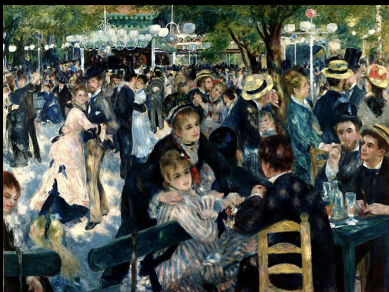
Pierre-Auguste Renoir Bal du moulin de la Galette (transl. as Dance at Le moulin de la Galette ), 1876 Oil on canvas 131 cm × 175 cm, 51.6 × 69 in Musée d'Orsay, Paris