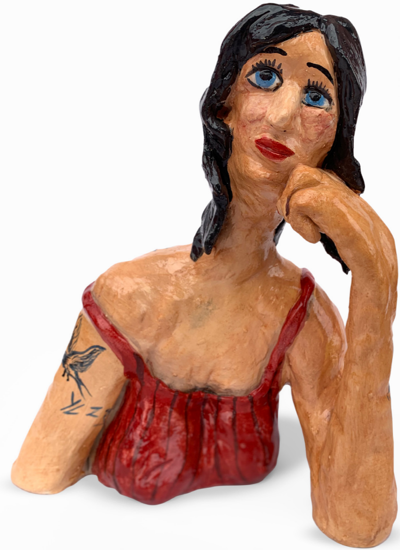
La femme pensante, 2023

Ceramic 20 x 25 x 30 cm 7 7/8 x 9 7/8 x 11 3/4 in