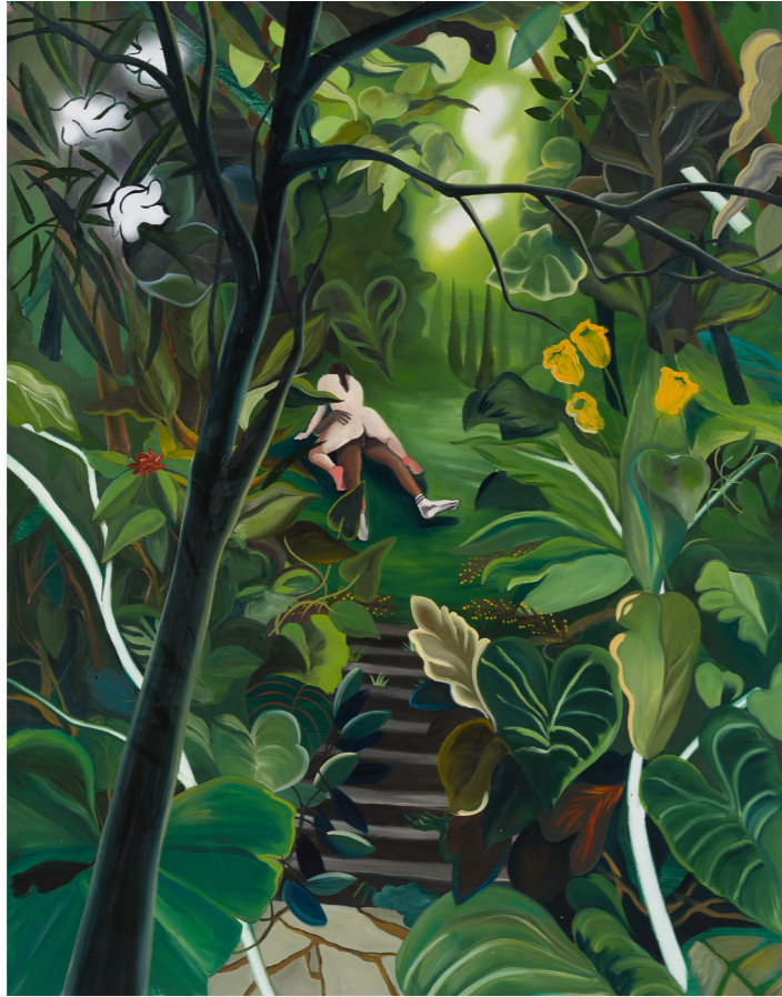
Sex in the Landscape, 2022

Oil on linen 160 x 122 x 3 cm 63 x 48 x 1 1/8 in