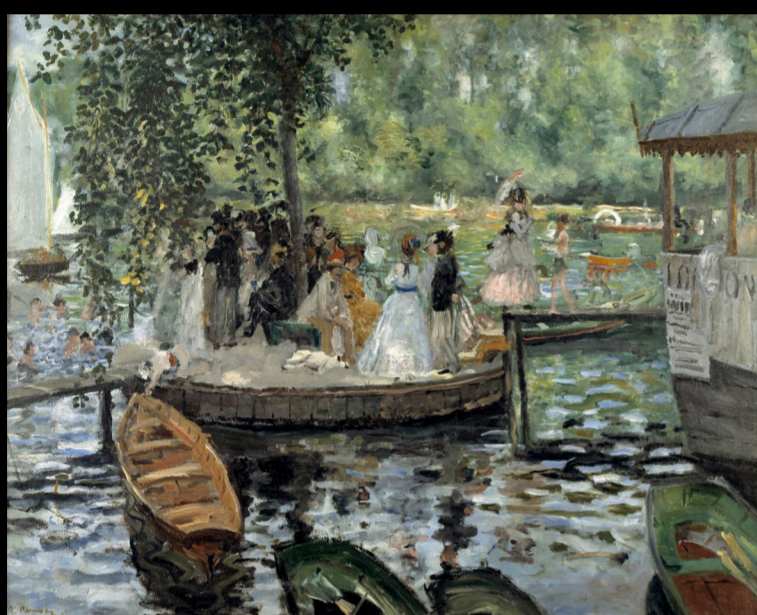
Pierre-Auguste Renoir La Grenouillère (transl. as The Frog Pond ), 1869 Oil on canvas 66.5 cm × 81 cm, 26.1 in × 31.8 in Nationalmuseum, Stockholm