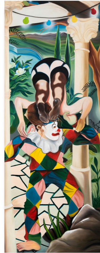
The Night is Young, 2023

Oil and airbrush on linen 201 x 331 x 3 cm 79 1/8 x 130 1/4 x 1 1/8 in