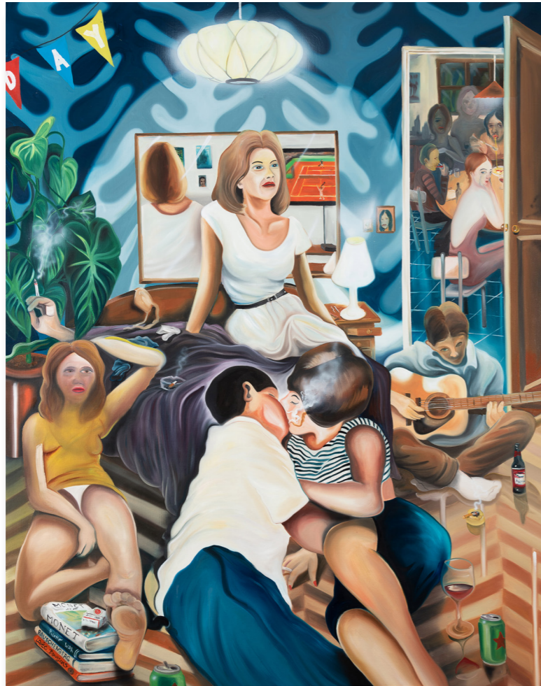
Game set and match, 2023