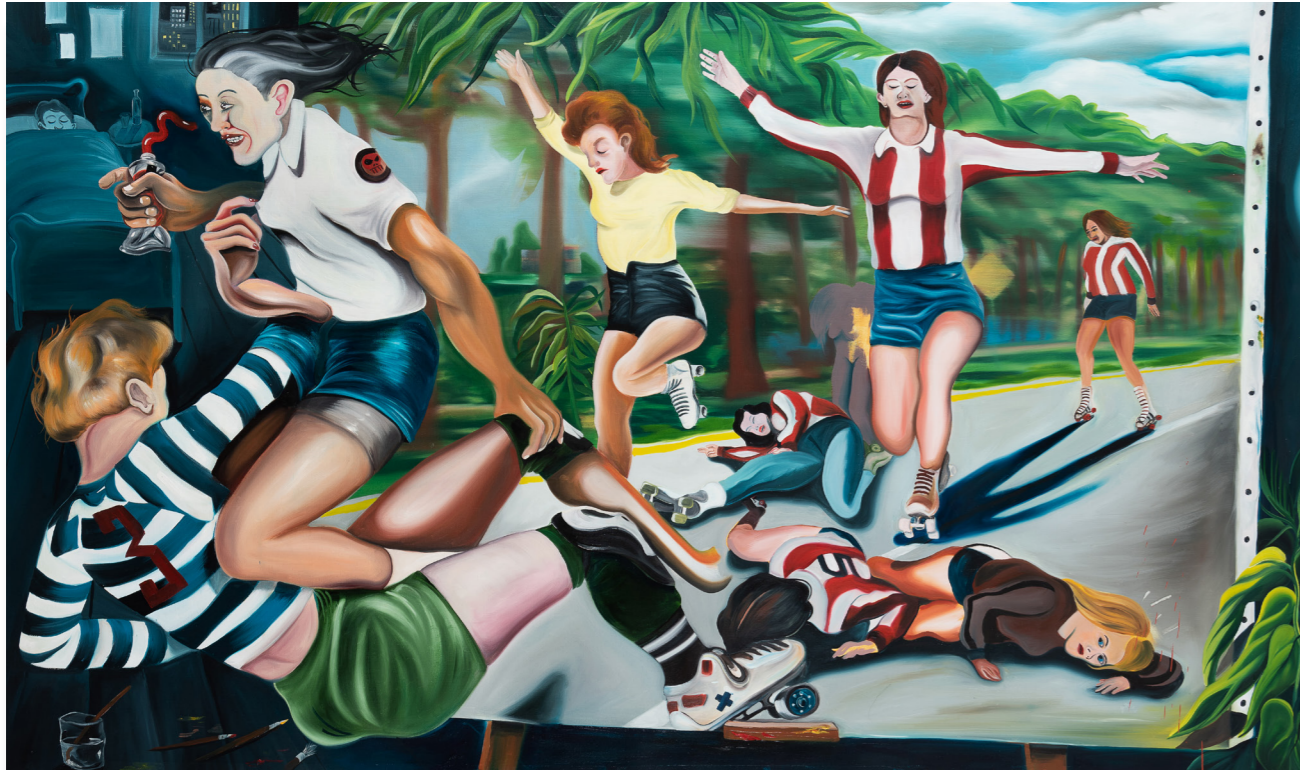
Roller Derby Queen, 2023