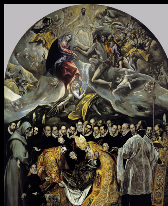
El Greco El Entierro del Conde de Orgaz (transl. as The Burial of the Count of Orgaz ), 1586 Oil on canvas 480 × 360 cm, 190 × 140 in Iglesia de Santo Tomé, Toledo