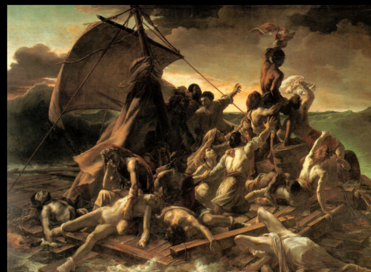
Théodore Géricault La zattera della Medusa , (transl. as The Raft of the Medusa ), 1819 Oil on canvas 491 × 716 cm Louvre Museum, Paris