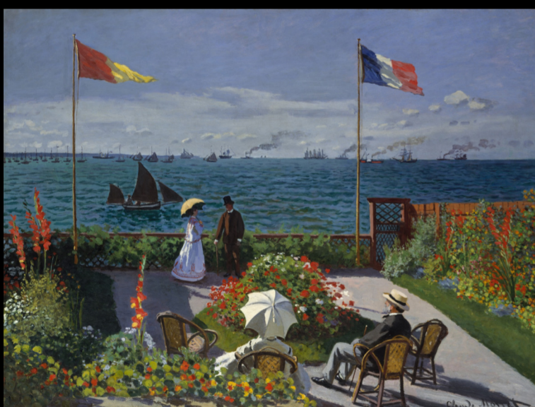
Claude Monet Terrasse à Sainte-Adresse (transl. as Garden at Sainte-Adresse ), 1869 Oil on canvas 66.5 cm × 81 cm, 26.1 in × 31.8 in Nationalmuseum, Stockholm