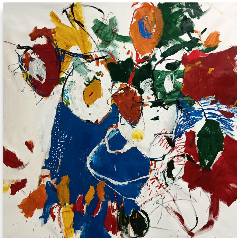
Composition for a bouquet of sunflowers and a jug, 2023

Oil, acrylic, oil bar and oil pastel on canvas 63 x 63 in 160 x 160 cm