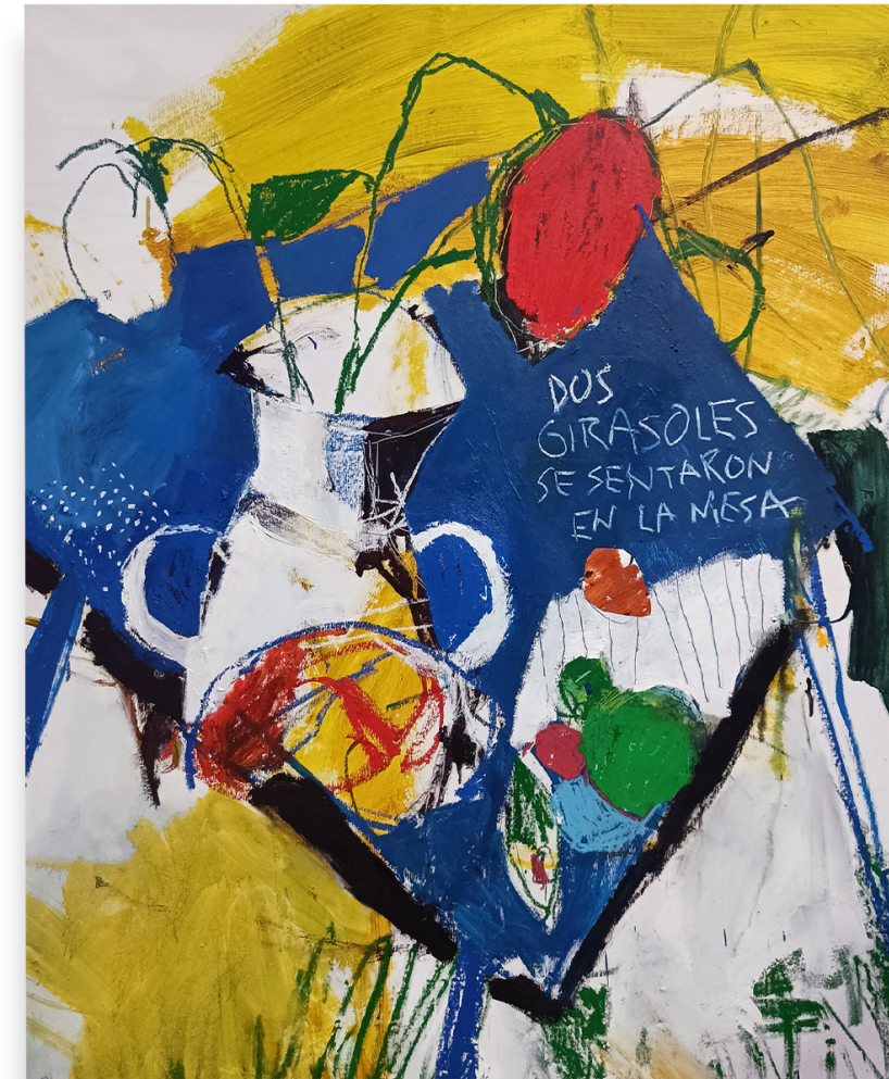
Composition for two Sunflowers, a pot, and a table, 2022

Oil, acrylic, oil bar and oil pastel on canvas 59 1/8 x 47 1/4 in 150 x 120 cm