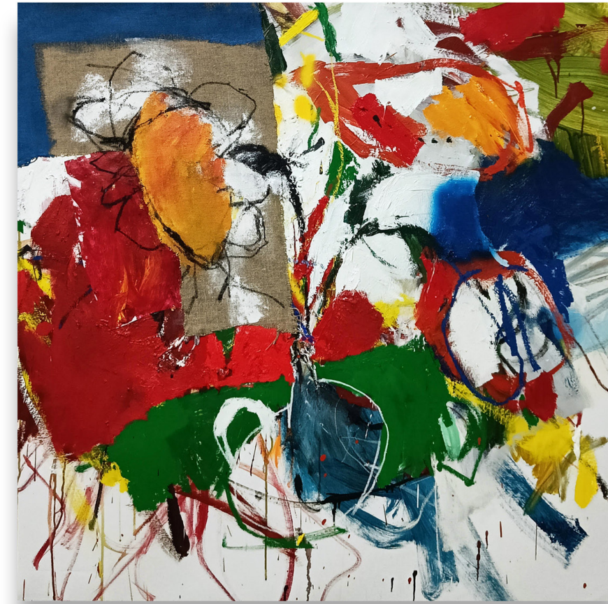
Composition for sunflower and jug, 2023

Oil, acrylic, spray, oil bar, oil pastel and stitched fabrics 47 1/4 x 47 1/4 in 120 x 120 cm