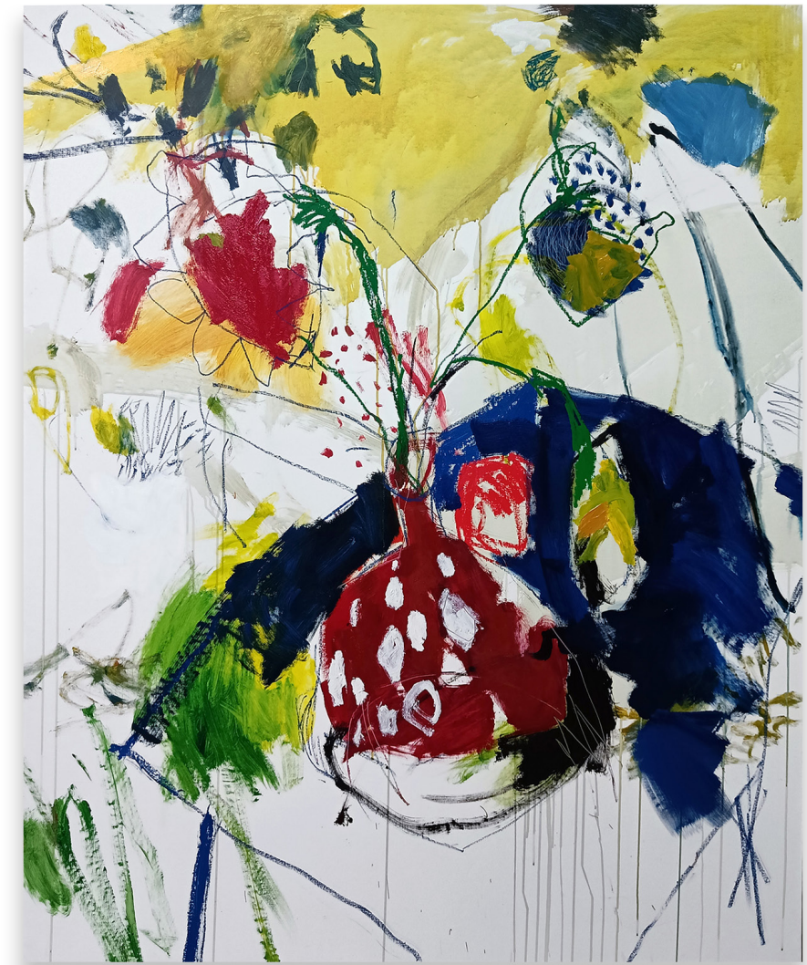
Composition for three flowers and a pot, 2023

Oil, acrylic, oil bar and oil pastel on canvas 78 3/4 x 63 in 200 x 160 cm