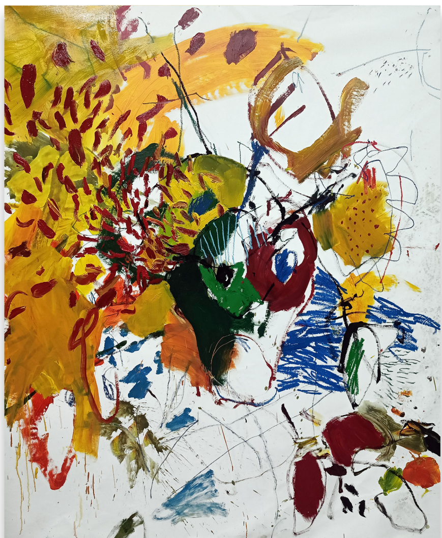
Composition for sunflowers and jug, 2023

Oil, acrylic, oil bar and oil pastel on canvas 78 3/4 x 63 in 200 x 160 cm