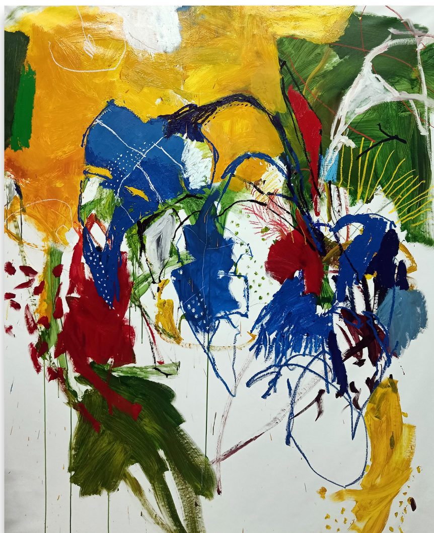
Composition for a blue banana tree, 2023

Oil, acrylic, oil bar and oil pastel on canvas 78 3/4 x 63 in 200 x 160 cm