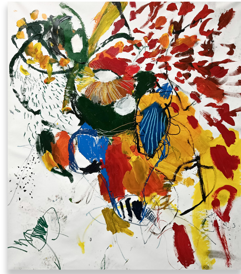
Composition for a jug and sunflowers, 2023

Oil, acrylic, oil bar and oil pastel on canvas 59 x 47 1/4 in 150 x 120 cm