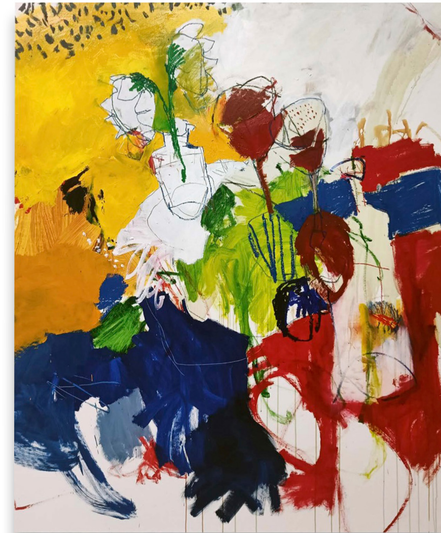
Composition for a Saturday's lunch, 2023

Oil, acrylic, oil bar and oil pastel on canvas 78 3/4 x 63 in 200 x 160 cm