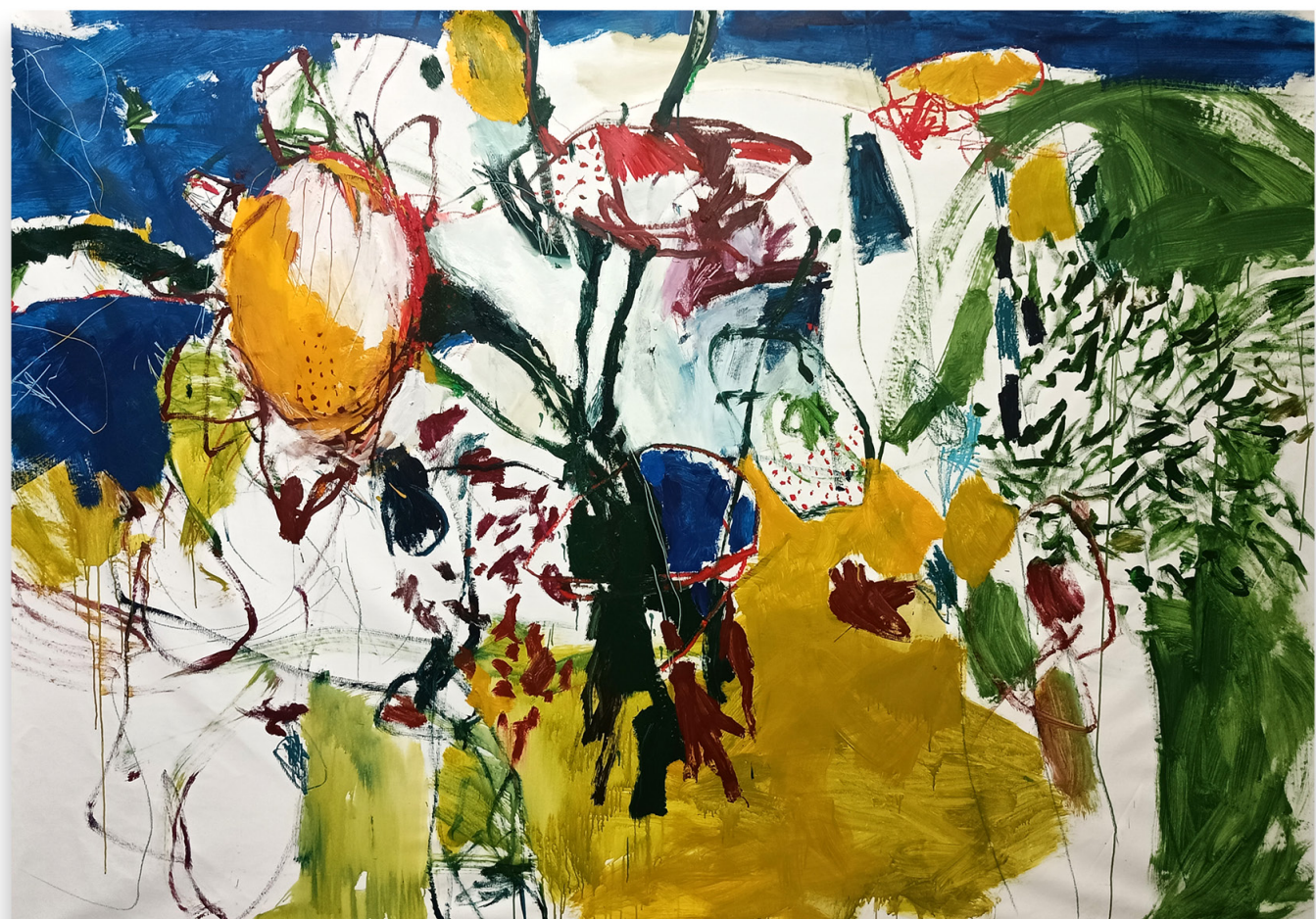
Composition for a bouquet of flowers, 2023

Oil, acrylic, oil bar and oil pastel on canvas 78 3/4 x 114 1/8 in 200 x 290 cm