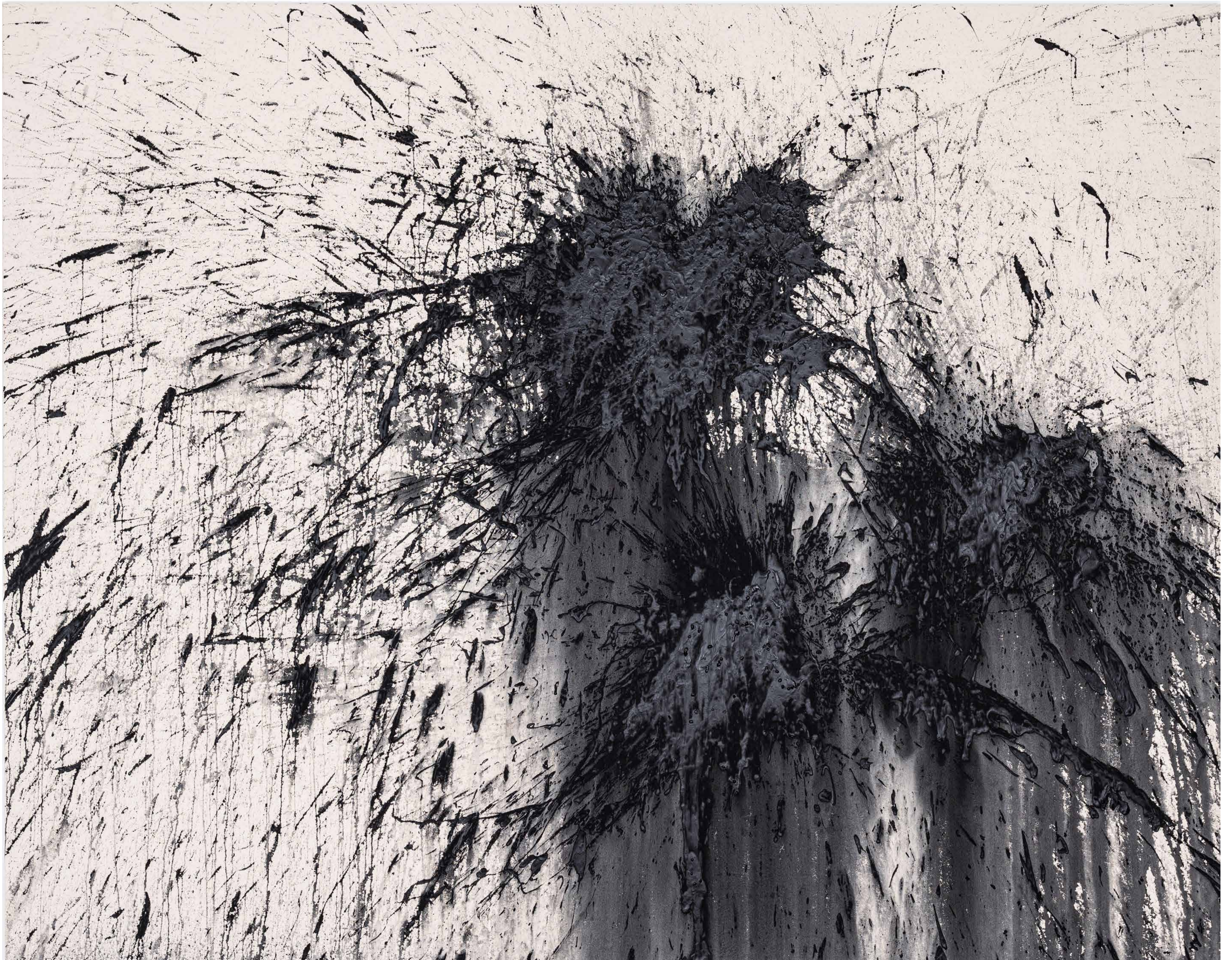
Untitled, 2023 Acrylic on canvas