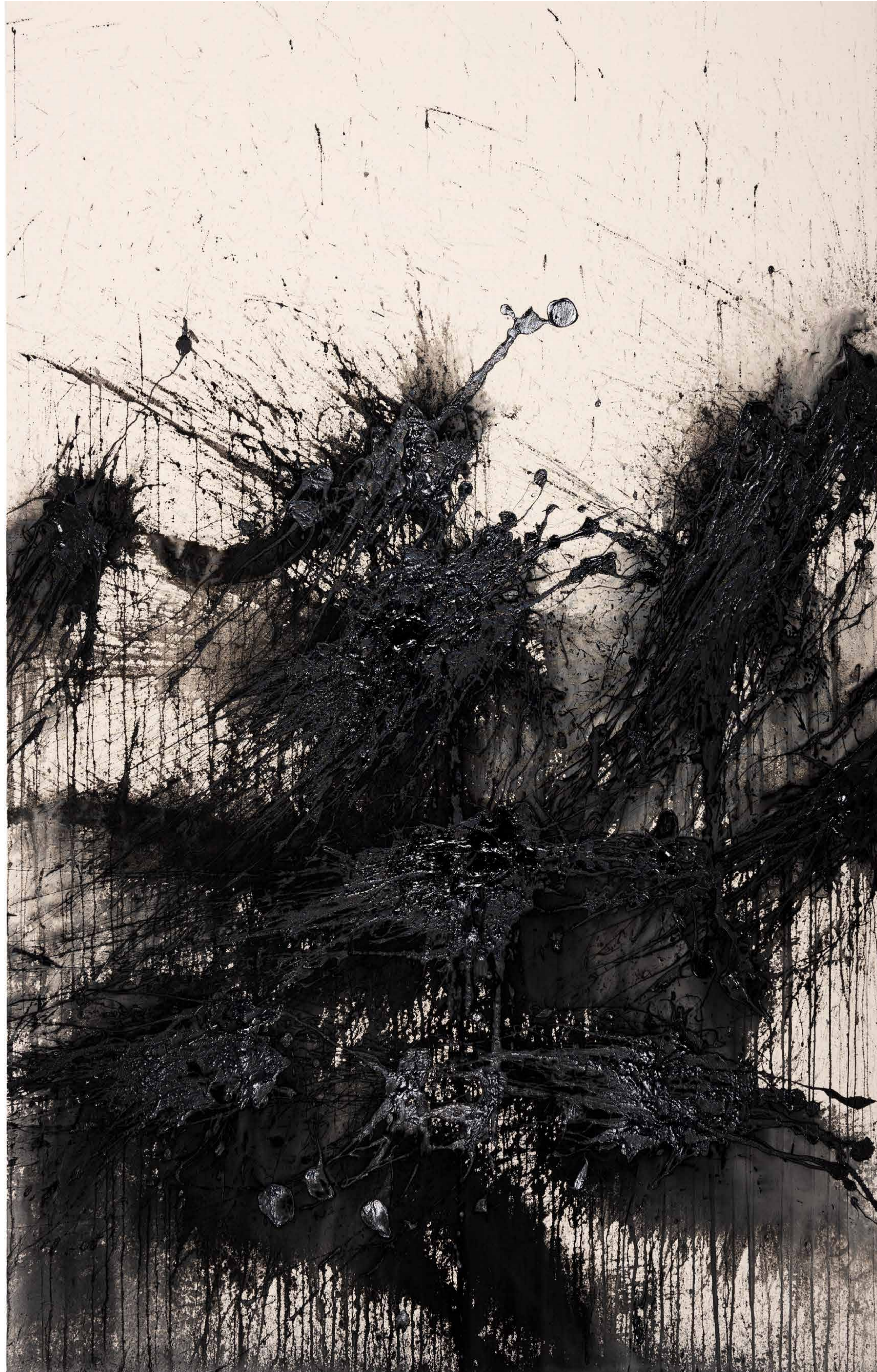
Untitled, 2023 Acrylic on canvas