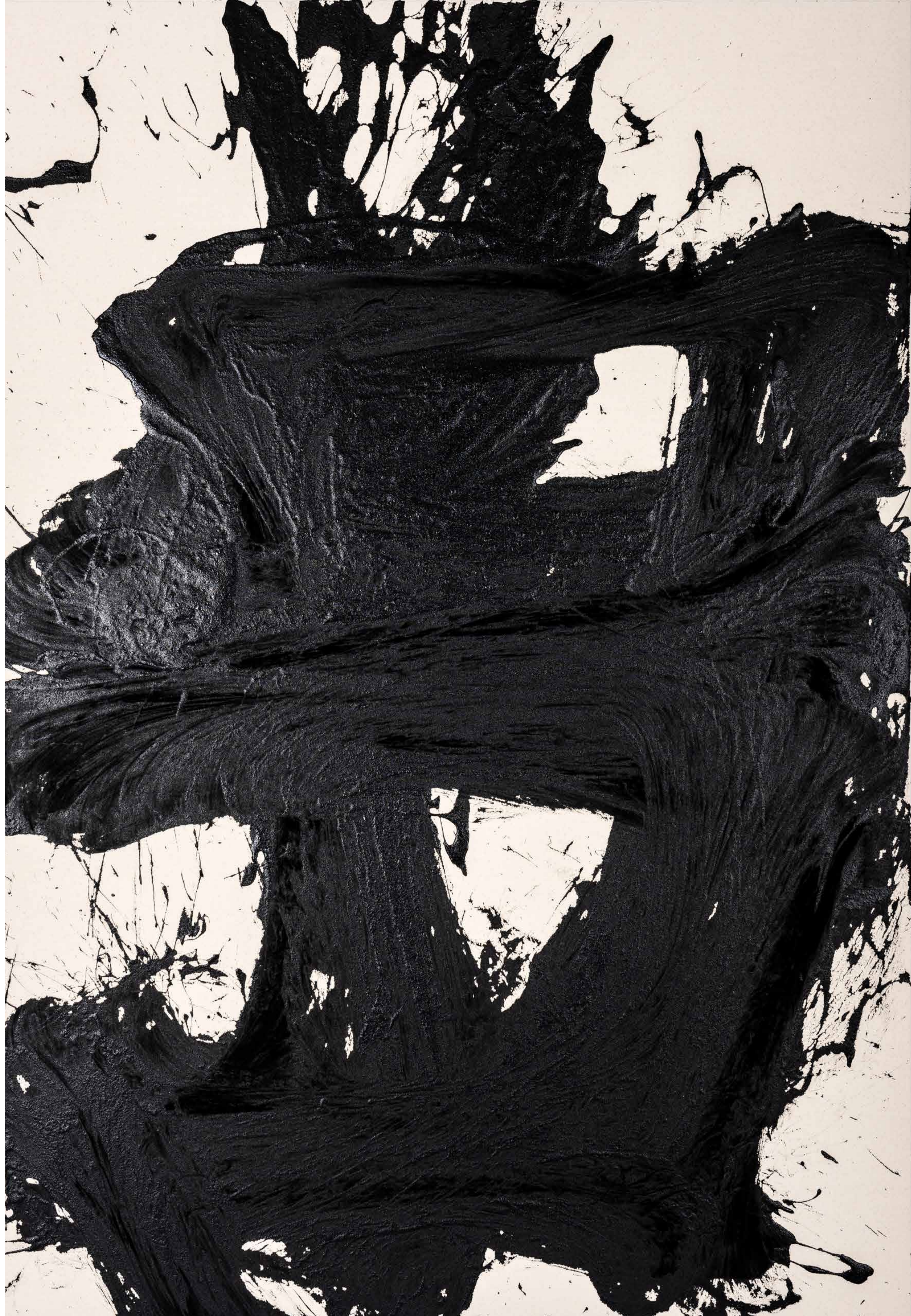
Untitled, 2023 Acrylic on canvas