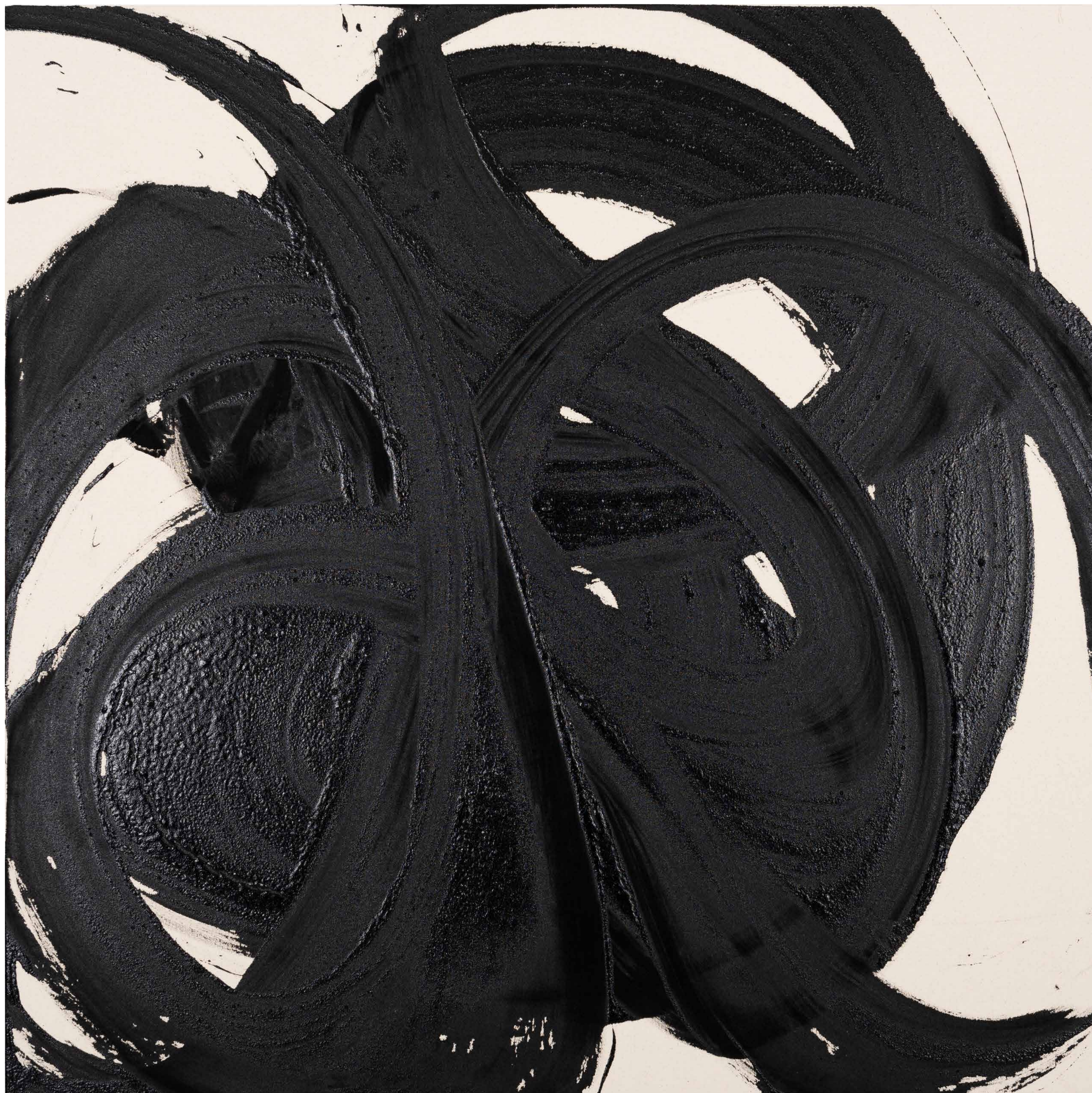
Untitled, 2023 Acrylic on canvas