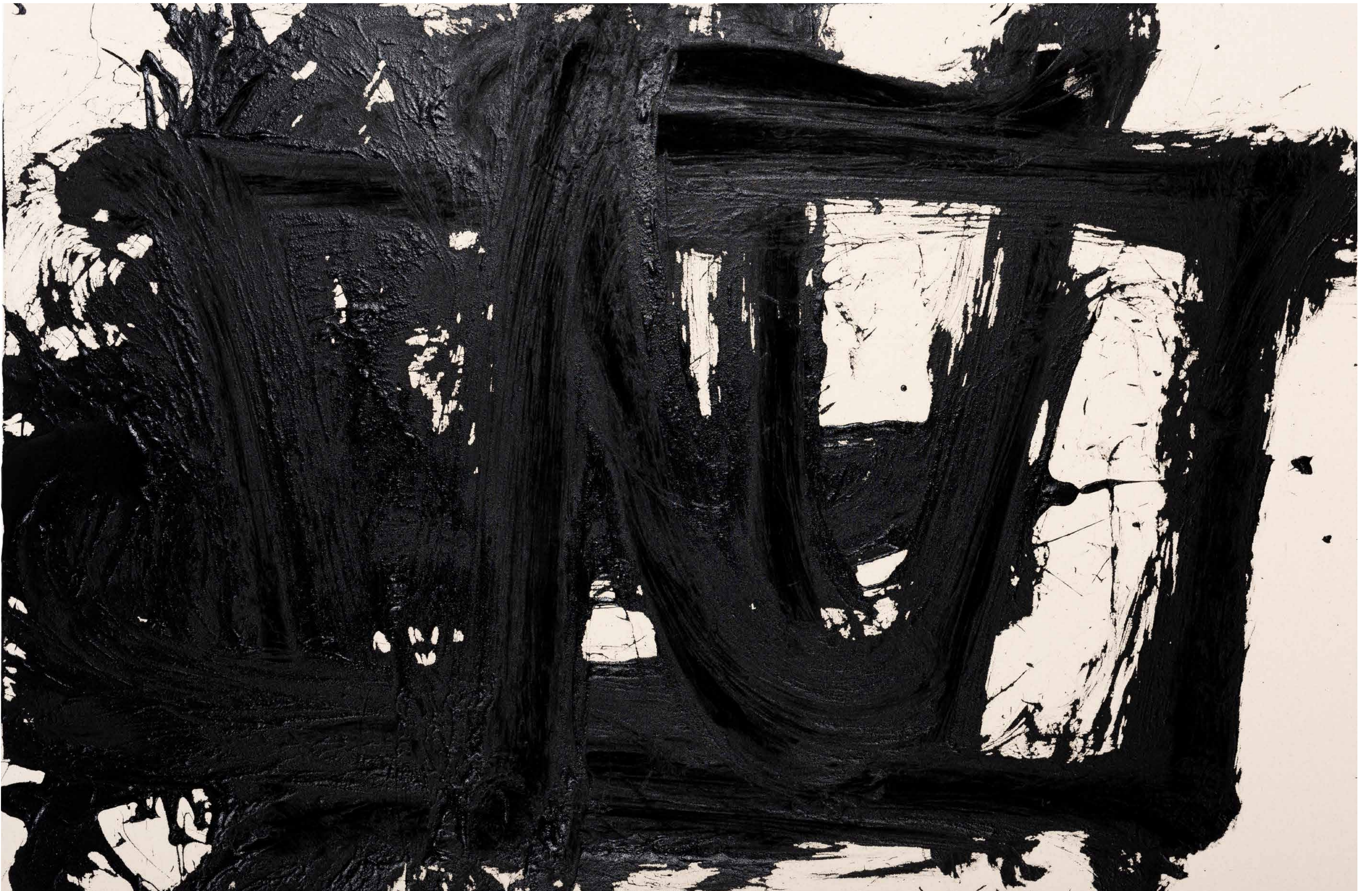
Untitled, 2023 Acrylic on canvas