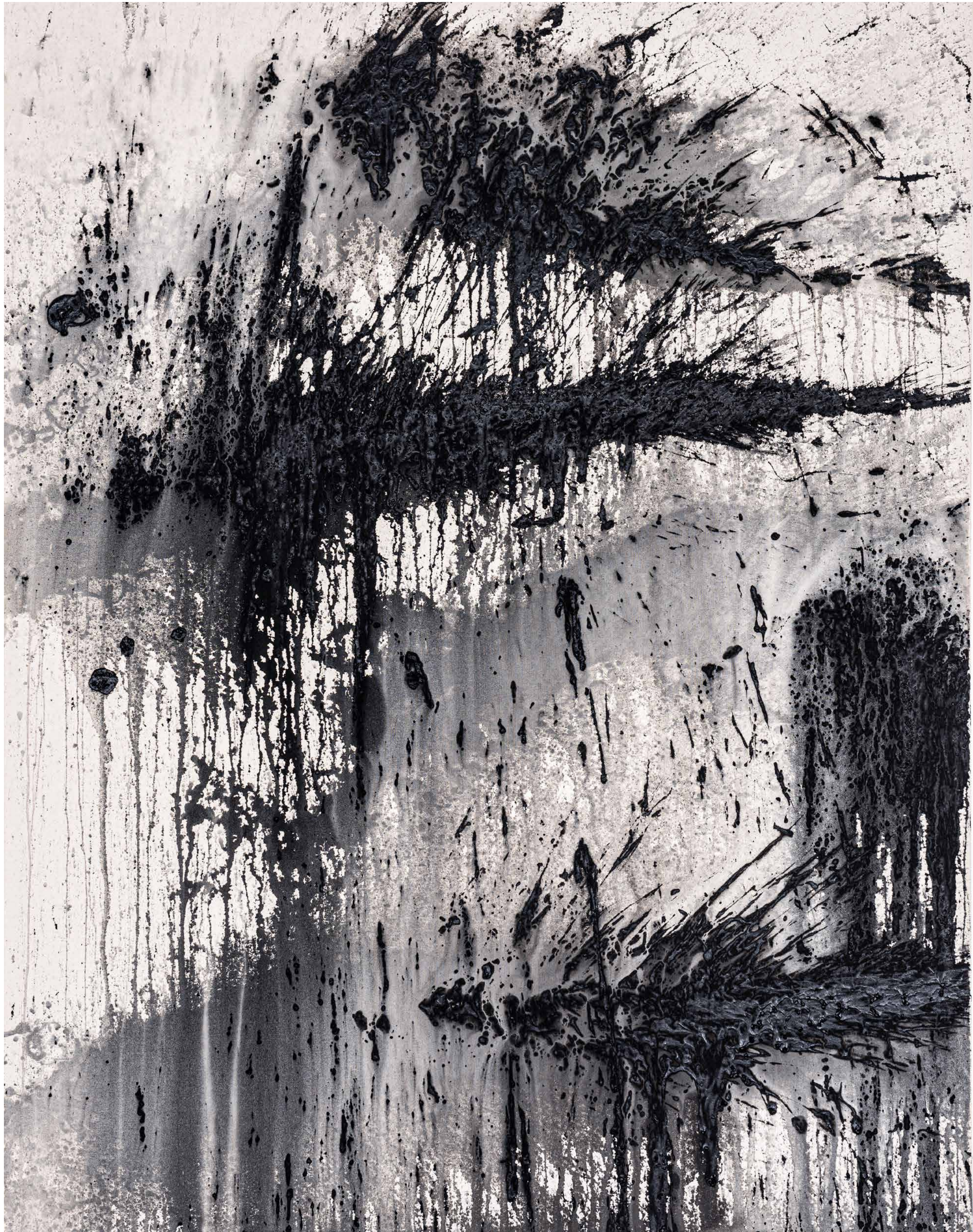
Untitled, 2023 Acrylic on canvas