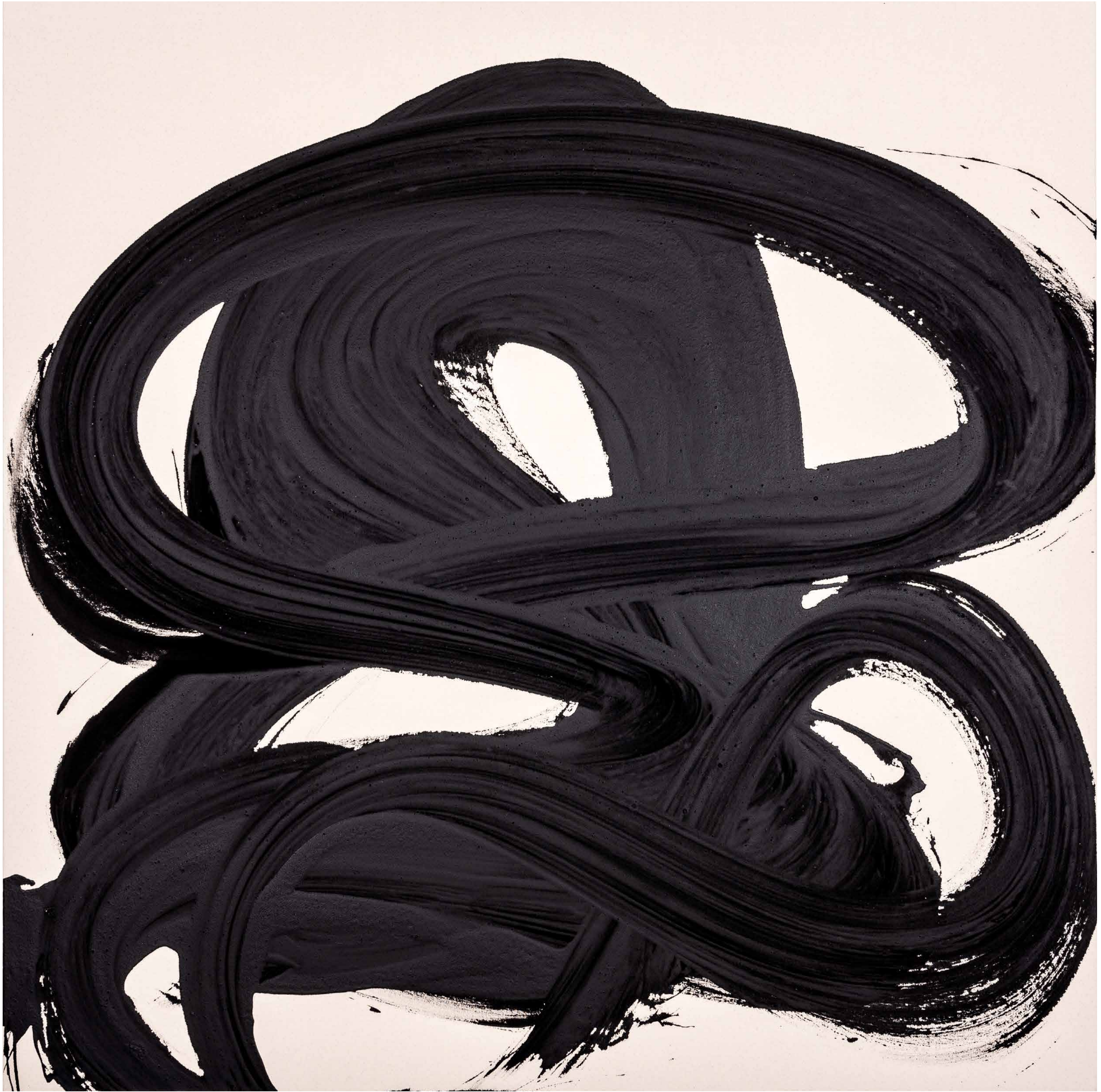
Untitled, 2023 Acrylic on canvas