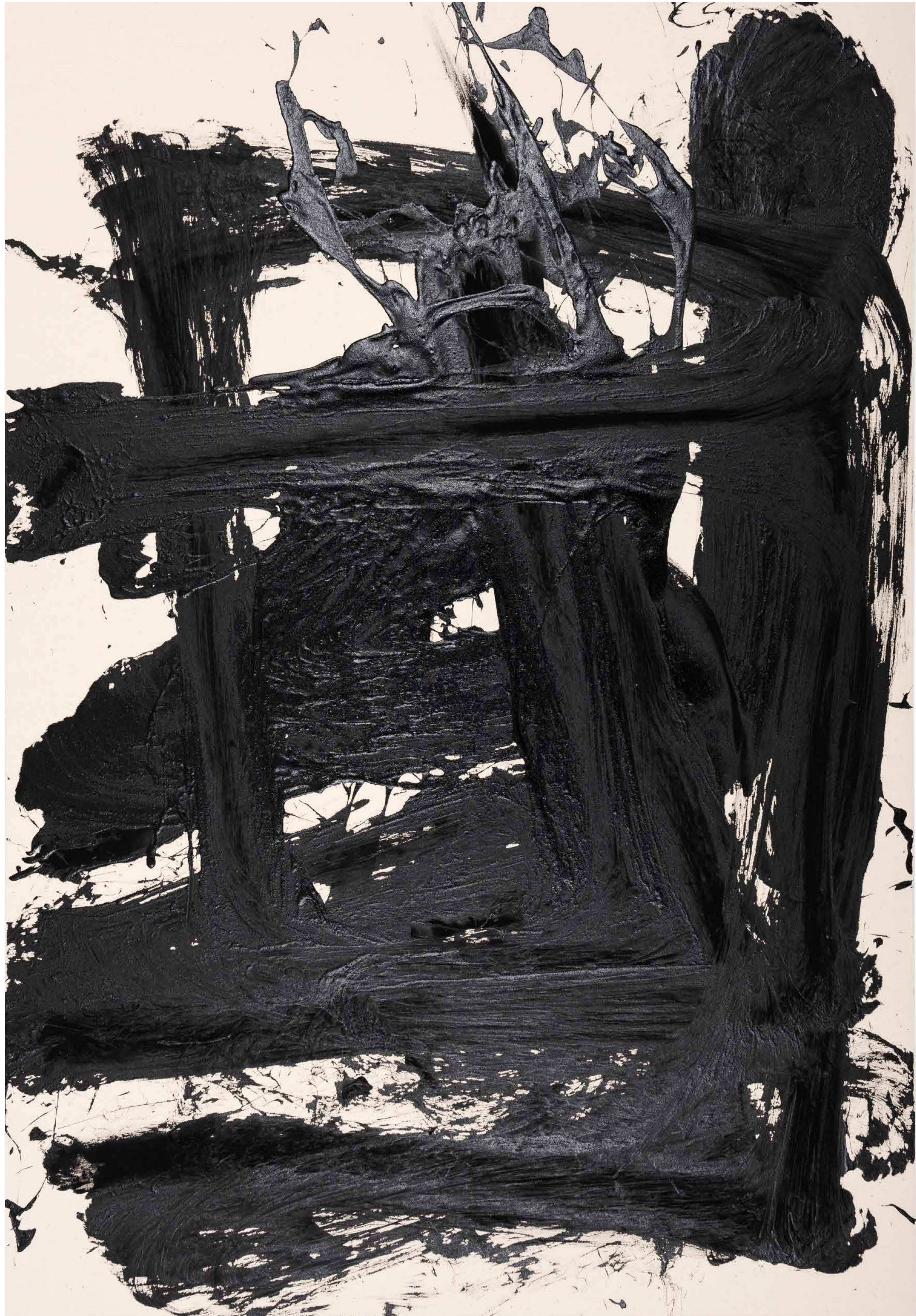
Untitled, 2023 Acrylic on canvas