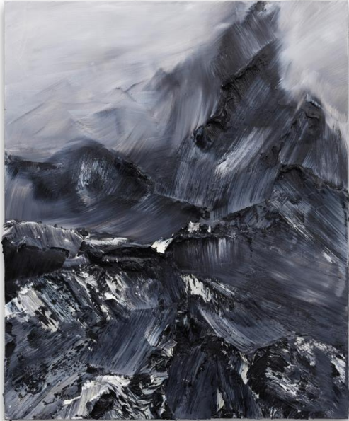
Conrad Jon Godly TO SEE IS NOT TO SPEAK#3 , 2018 Oil on canvas 170 x 140cm